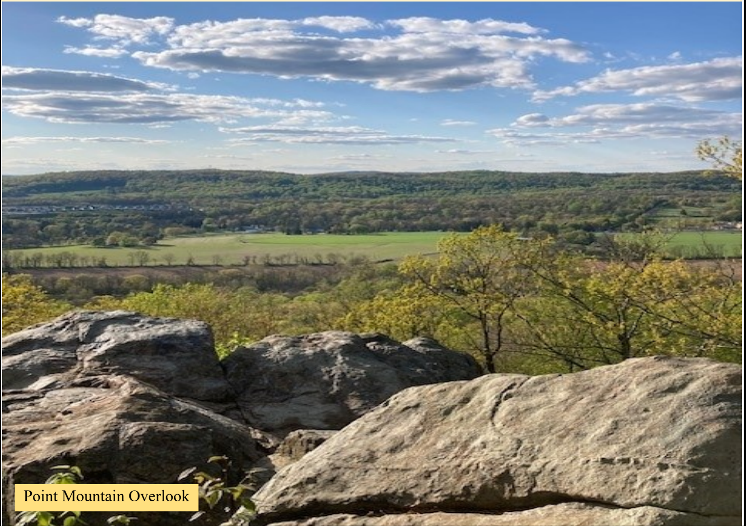
Point Mountain Overlook

Programs in September, October and November